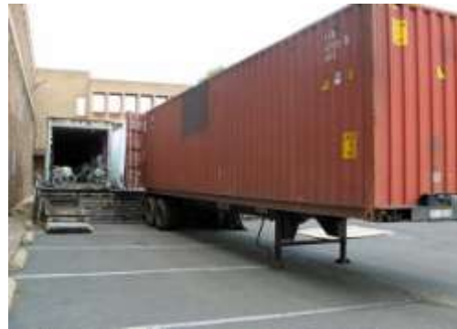
Bikes for Panama container

PCPF members and their friends and family loaded a shipping container with 574 bikes for Panama on Saturday, October 16 th , in McLean, Virginia. The bicycles, equipment and supplies were collected by Bikes for the World in the Washington, DC, and the mid-Atlantic area. The bikes will be donated to the Asociación Panameña de Industrias de Buena Voluntad (Goodwill Industries) who trains Panamanians to repair and prepare the bikes for sale. They then sell the bikes to teachers, workers, students, and others who need low-cost transportation. See video . Peace Corps Panama Friends has packed four containers for Panama over the past two years with over 1,600 bikes.