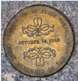
University of Michigan floor marker

Since 1961, when then Senator John F. Kennedy tasked us to promote world peace and friendship, more than 200,000 volunteers in 139 countries have answered that call.